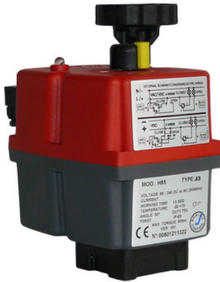
The all new J3 - 85

Visual indication of the actuator's operating status is constantly shown by a highly visible LED light.