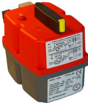
The J3 - 20 quarter turn electric valve actuator

Visual indication of the actuator's operating status is constantly shown by a highly visible LED light.