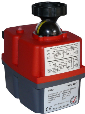
The new J3C - 35 Quarter turn electric valve actuator

Visual indication of the actuator's operating status is constantly shown by a highly visible LED light, and the new highly visible dome indicator, introduced in 2011